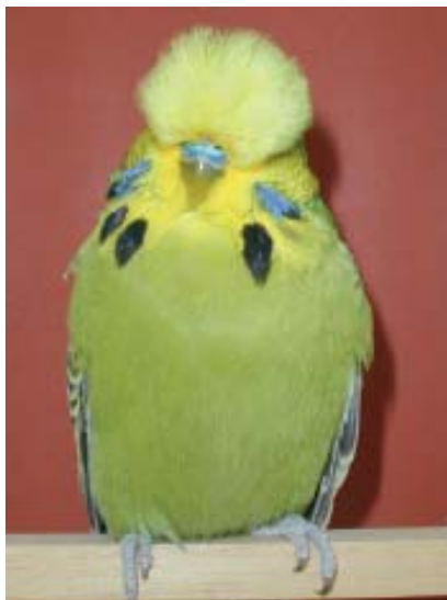
Best in Show at the 2002 NGC-DBS (Dutch National) Grey Green cock bred by Backx, Cuyten & Maas